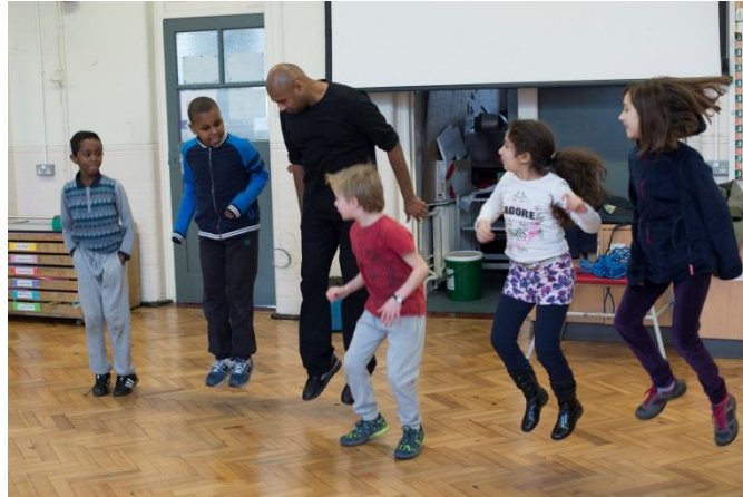
Permission divine to reproduce.

If mistakes happen, which they will, enforce the idea that it is everyone's responsibility. While the group is working together, we must all concentrate all the time so that we can make sure that the right people jump together. Also reinforce that we must take our time and wait until everyone is ready.